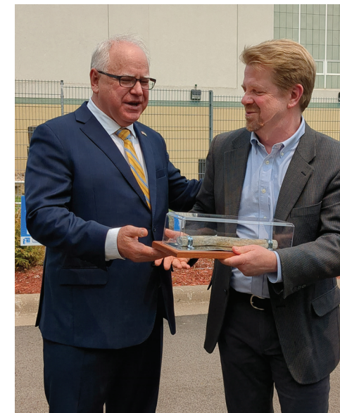
left: Governor Walz signed the Lead Pipe Bill on May 16, 2023.