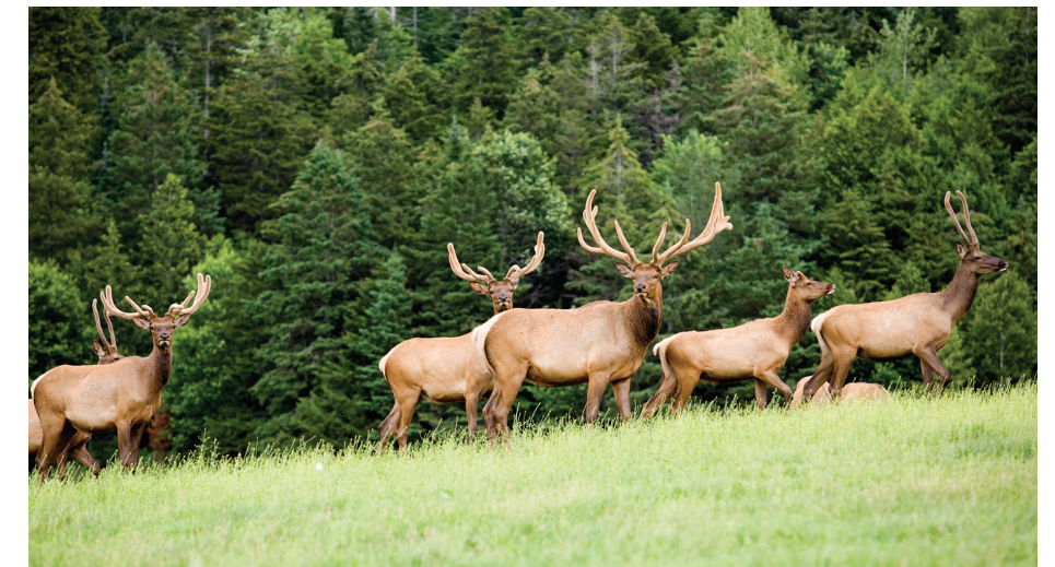
above Elk | cover Canoeing on the Saint Croix River | postal side Eastern bluebird, among the first songbirds to migrate back to Minnesota in spring